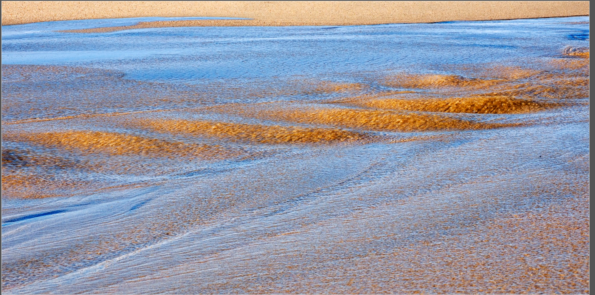
Sand Etched by Water