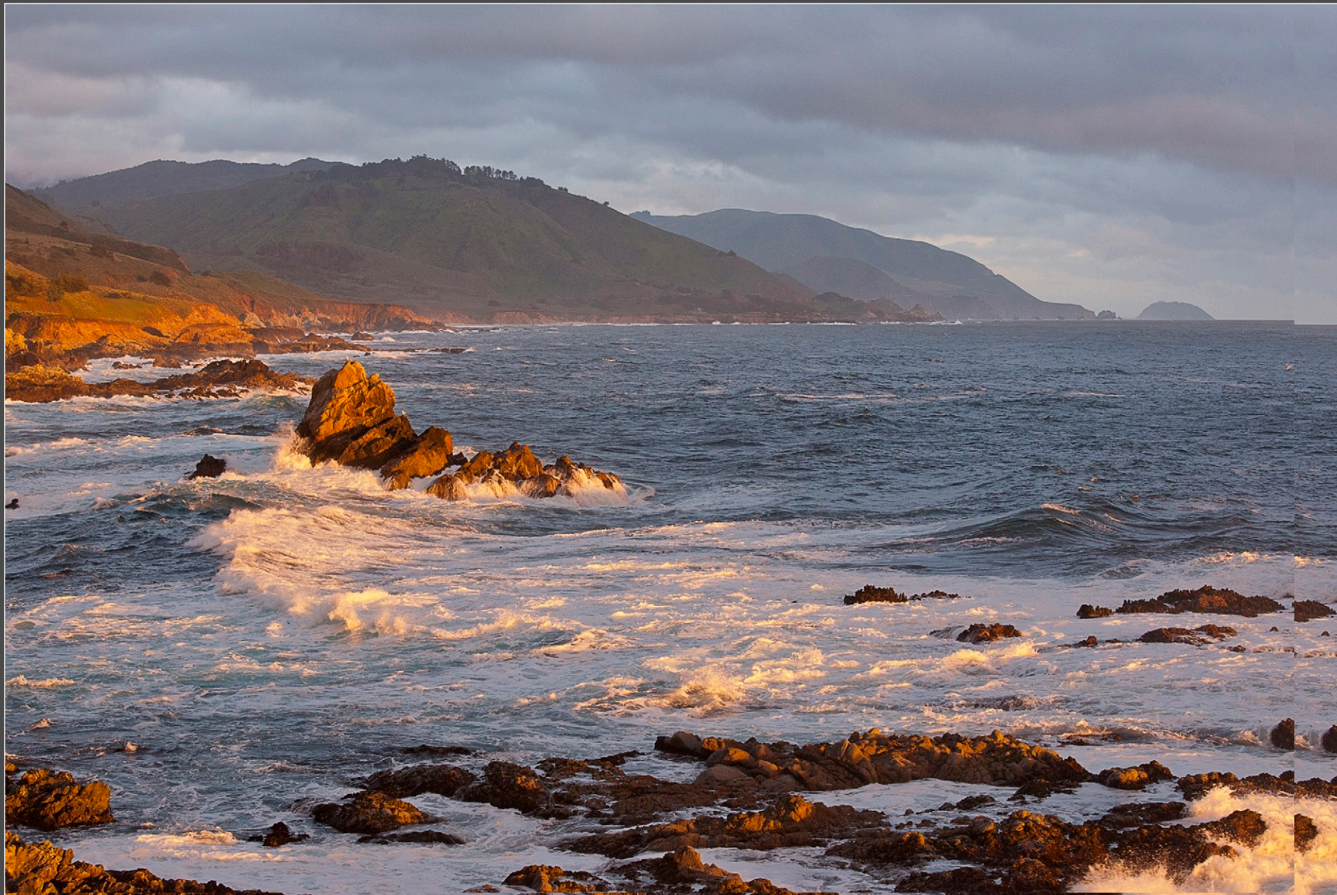
View From Gate #10

The Magic of Garrapata by Jim Messer a JMP Publication