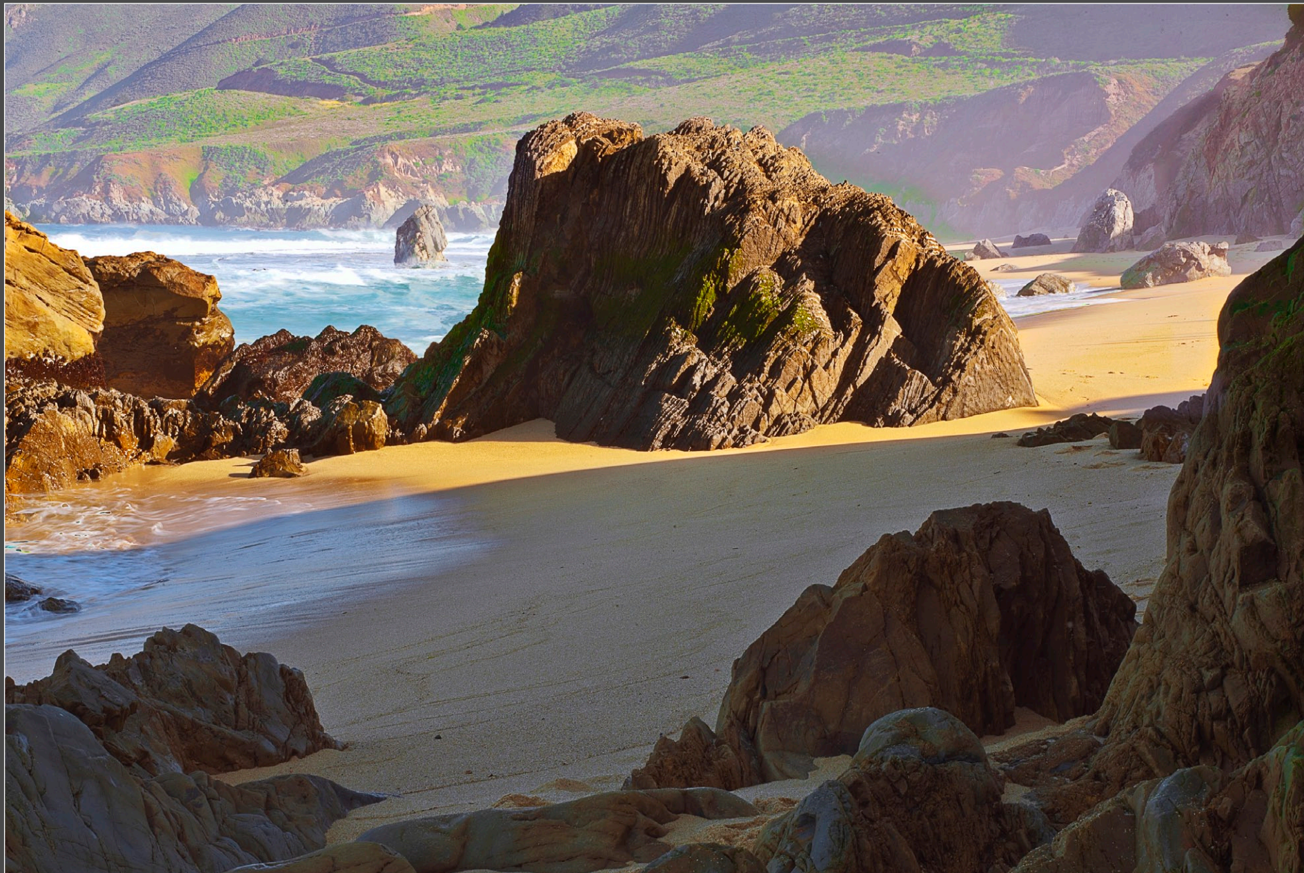
Sun and Shade: Beach Morning

The Magic of Garrapata by Jim Messer a JMP Publication