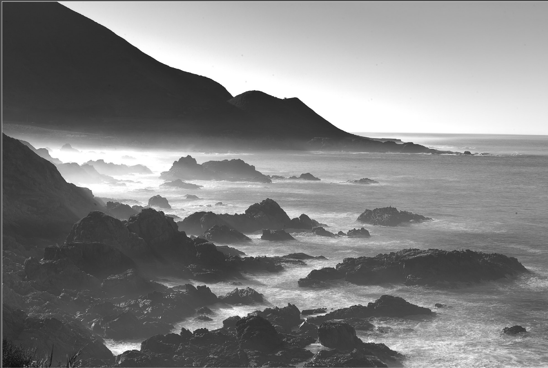
Coast in Morning Mist