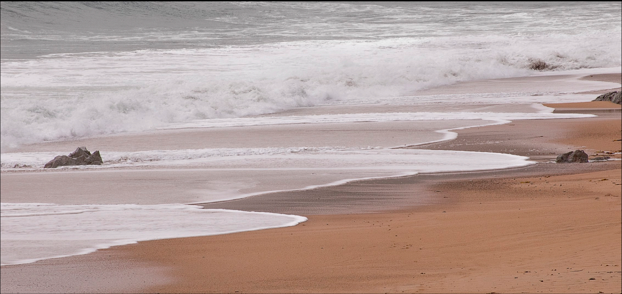
Beach and Wave