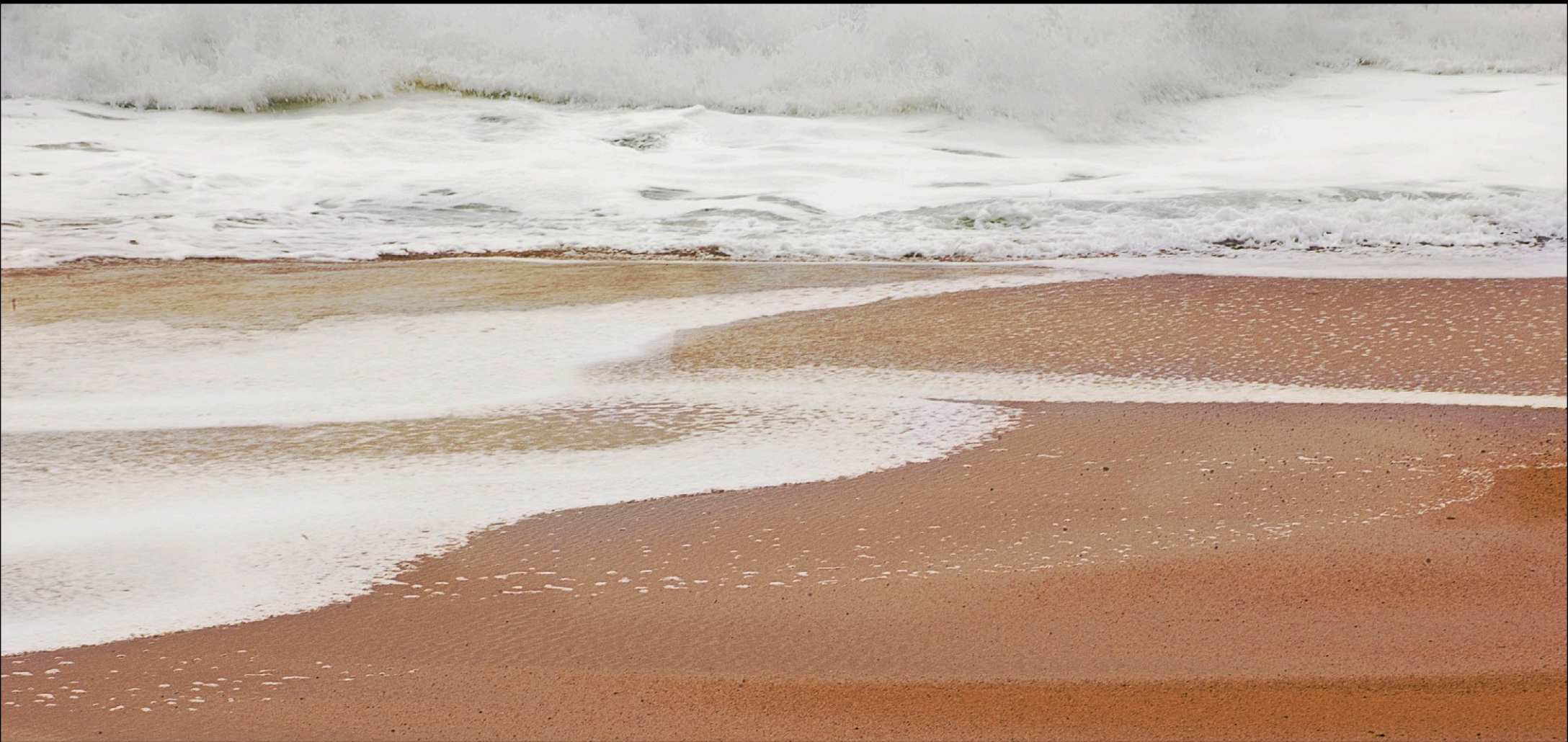
Beach and Waves #4