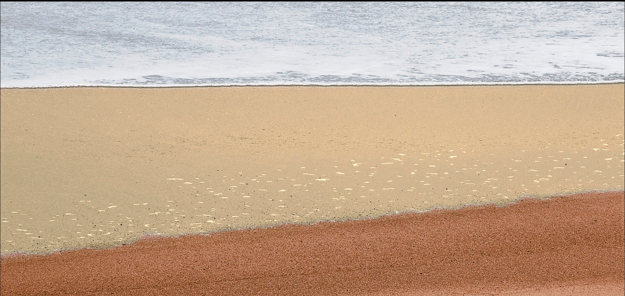
Beach and Wave #5