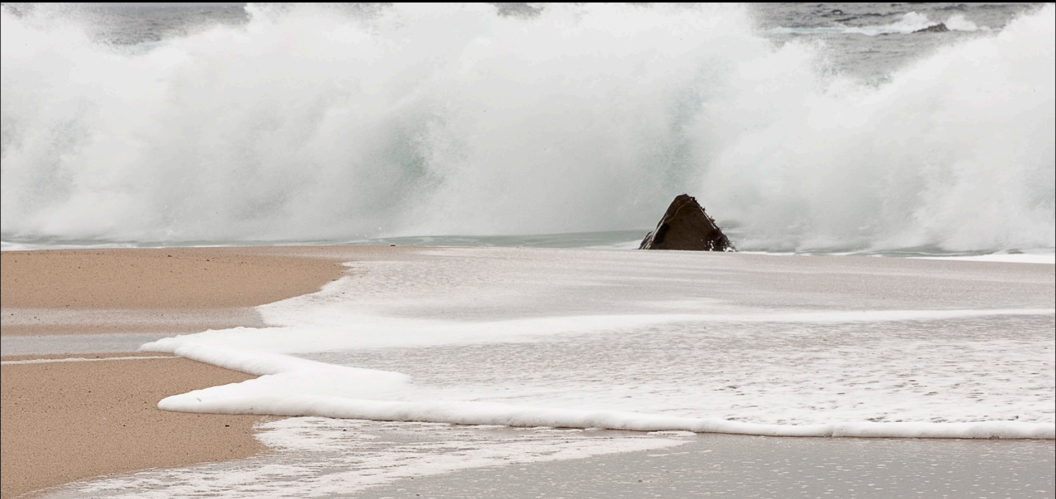
Beach and Wave #2